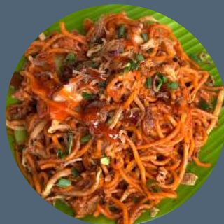
MEE GORENG MAMAK RM5.00