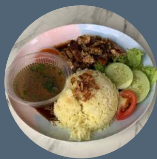
NASI AYAM RM5.00