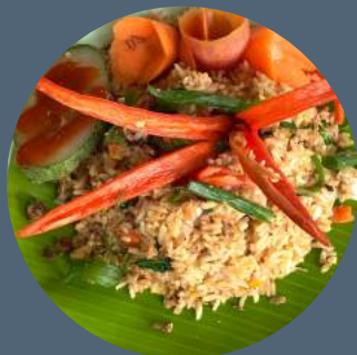
NASI GORENG KAMPUNG RM4.50