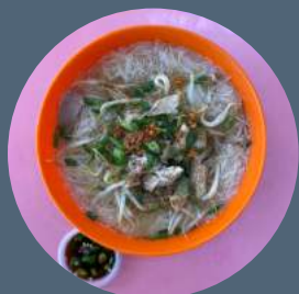
BIHUN SUP BIASA RM4.00