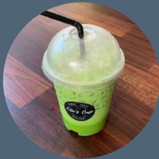
GREEN TEA RM2.80