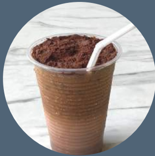
MILO AIS RM2.30