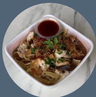
MEE SUP RM5.00