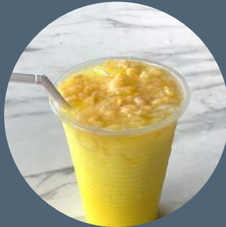
JAGUNG AIS RM2.00