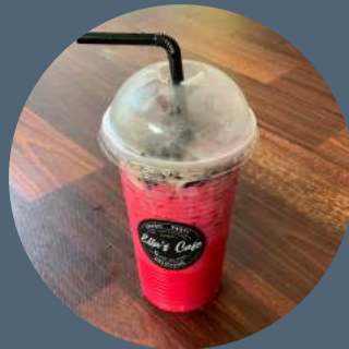
AIS BLENDED RM4.00