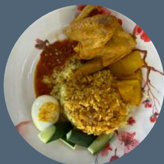
PECAL AYAM RM5.00